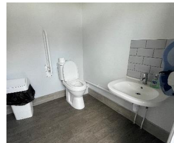
Toilets for less abled visitors near the Ticket Office