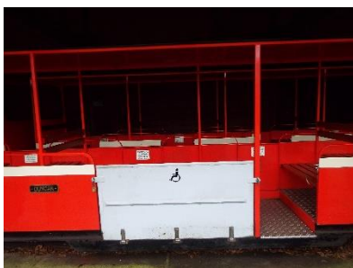
'Duncan' the accessible carriage

There is an adapted carriage ('Duncan') which is 86cm wide with a ramp which is 126cm wide. The carriage also includes two standard seats for family and friends. Please call prior to your visit if you require this carriage.