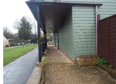
Ramp leading up to the central toilet block.