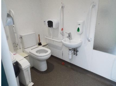
Central toilets – facilities for less abled visitors.

There are two separate toilets for visitors with disabilities located at the far end of the building. The doors pull outwards and are 90cm wide. The toilet seat is 49cm from the floor.