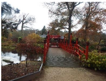
Ramp leading to the one of the Japanese bridges.

The area near the frog fountain is made of concrete. There is a ramp going down one side and five steps the other.