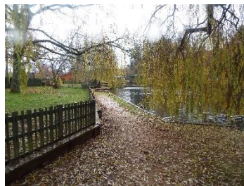
Gravel paths alongside the Inner Lake.