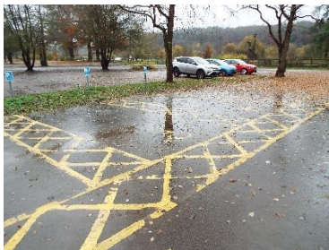
Car parking for less abled visitors

These toilets include a toilet for disabled visitors which has a door with a width of 96cm (and pulls outward). The toilet seat is 56cm high from the floor which is non-slip. There are lever taps at the basin.