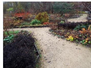
Gravel paths in the Japanese Garden.