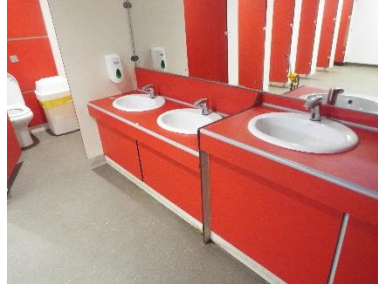
Low level basin in the main ladies toilets (in the men's toilet there is one low level basin).