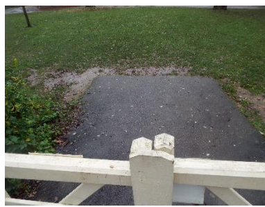
The exit gates from the railway platform.